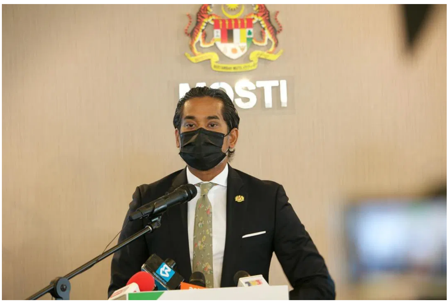
Khairy Jamaluddin, head of the Covid-19 Immunisation Task Force (CITF), speaks at a press conference on February 17, 2021.

Defence and security personnel are listed as frontline workers because they can be mobilised at any time to "high risk areas", says the Covid-19 Immunisation Task Force.